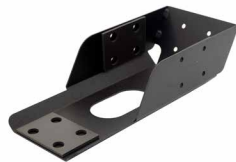
7160-1380 Pistol Grip Scanner Bracket