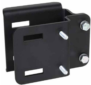
7160-0418 For Yale/Hyster, Crown, and others 7160-1542 For CLARK 7160-0814 For Jungheinrich / CAT / Toyota 7160-0815 For Linde Models EV-30 and EV40

Pair with with DUAL CLAM SHELL MOUNT (PG.5) to complete your solution