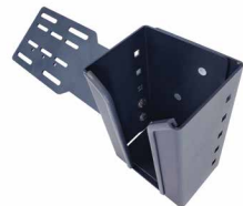
7160-1389 Scanner Pocket Tablet Mount