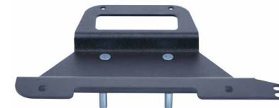
7160-0817 Zebra ZQ630/QLN420 Printer Bracket

Continue to expand from a desk to a mobile work environment by creating a secure and accessible way to mount rugged mobile printers.