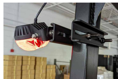
7160-1719 Forklift Light Mount