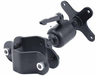
Zirkona 7160-1356-01 Zirkona 2" to 3" Pole Mount with VESA 75mm Mounting Plate 7160-1356 Zirkona 2" to 3" Pole Mount with AMPS/NEC Mounting Plate