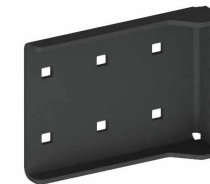
7160-1096 Clamp Bracket Adapter