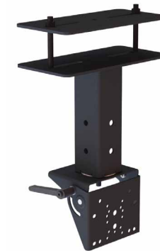
7160-0368 Overhead Guard Mount with Single Clam Shell