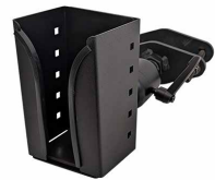
7170-0788 Zirkona 4" Diamond Mount w/Scanner Pocket