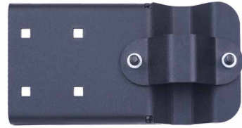
7160-0561 2", 2.5", 3" Diameter Tube Clamp

Expand your mounting location options by connecting your solution to multiple sizes of cylindrical poles, handles, or tubular style overhead guard legs. Adapt a Clam Shell product to finalize the total solution.