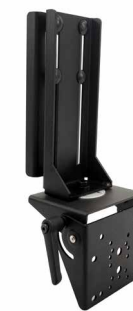
7160-1156-01 Tall Overhead Bar Mount