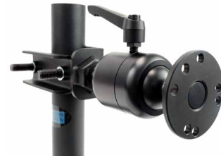
Zirkona 7160-1367-01 Zirkona 3/4" to 1 7/8" Pole Mount with VESA 75mm Mounting Plate 7160-1367 Zirkona 3/4" to 1-7/8" Pole Mount with AMPS/NEC Mounting Plate