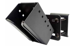
7160-1306 Scanner Pocket Mount with Small Back Plate

Safeguard handheld scanners from accidental drops and catastrophic damage by housing your device with the right mount to fit your operation's needs.