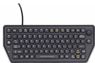
iKey Rugged Keyboard *See website for full assortment