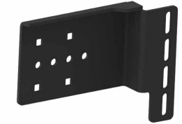
7160-1233 Toyota Cab Mount