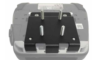
7160-1053 Zebra ZQ500 Printer Mount