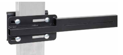
7160-0363 Horizontal Extension Bar

Increase your usable mounting space with our horizontal extension giving you more room to mount a total solution. Compatible with all Gamber-Johnson's roll formed and tube clamp brackets to ensure secure fitment to any overhead guard leg profile.