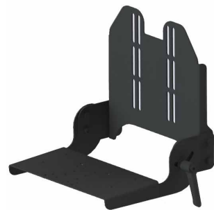
7160-0799 Tablet Keyboard Mount 7160-0799-01 Tablet Keyboard Mount - Tall Backplate

Configure your keyboard for ultimate ease of use and the fastest possible access with our large selection of Keyboard Mounts. With an ergonomic angle that meets user needs, working on the keyboard in the field can be more streamlined and reliable than ever before.