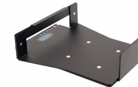
7160-1693 ZEBRA ZD620D, ZD620T, ZD621D, and ZD621T, 75MM HP Printer Mount