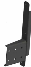
7160-1109 Yale/Hyster Electric Bracket