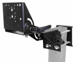
7160-0420 Dual Clam Shell with Arm and Small Backer Plate 7160-0421 Dual Clam Shell with Arm and Large Backer Plate