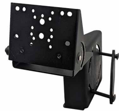
7160-1995 Guard Leg Mount