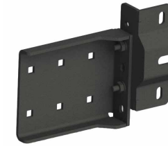
7160-1151 Toyota Cab Latch Mount for Electronic Hydraulics

Secure your valuable tablets and devices right in the cab of your material handling vehicle using one of our reliable OEM specific mounts. Perfectly suited to tailor your workspace to the most efficient, ergonomic, and secure configuration, all while protecting your valuable assets and lift vehicle operators.