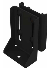
7160-0610 Single Light Bracket

Mount safety lights to present a visual alert to help increase warehouse safety, minimize the risk of accidents, and improve visible awareness of approaching lift vehicles.