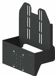
7160-1257 Vertical Tablet Keyboard Mount 7160-1257-01 Vertical Tablet Keyboard Mount - Tall Backplate