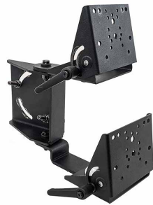
7160-2020 Guard Leg Mount with Dual Arms