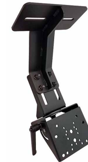
7160-1425 Overhead Guard Cab Mount