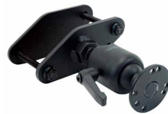
Zirkona 7160-1261 Zirkona 4" Diamond Plate with Large Joiner and AMPS/NEC Plate 7160-1261-01 Zirkona 4" Diamond Plate with Large Joiner and VESA 75mm Plate

When it comes to mounting lightweight devices turn to Gamber-Johnson's diamond plate mounts for a reliable solution. Multiple product offerings to interface your device with various hole patterns and ample adjustability to accommodate operator comfort and ease of use.