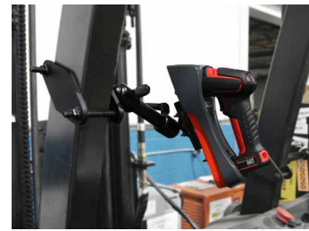
7170-1050 Zebra DS3678 Scanner Cradle Pivoting Mount Kit