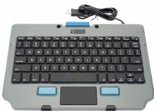
7160-1449-00 Rugged Lite Keyboard