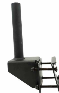
7160-1810 Shrink Wrap Mount - Small Back Plate