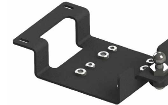
7160-1473 Zebra ZQ620 Printer Bracket