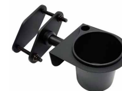
7160-1669 Fixed Forklift Cup Holder Mount