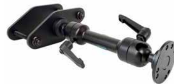
Zirkona 7160-1466 Zirkona, 4" Diamond Plate with 6" Medium Dog-Bone and AMPs Plate 7160-1466-01 Zirkona, 4" Diamond Plate with 6" Medium Dog-Bone and VESA 75 mm Plate