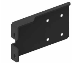
7160-1103 Linde E30 Latch Mounting Bracket