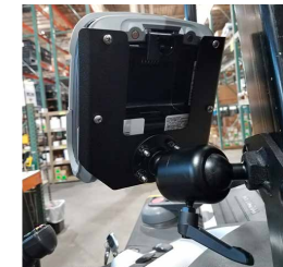
7160-1816 Honeywell RP4 Printer Mount