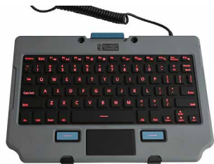
7170-0817-01 Rugged Lite Backlit Keyboard and Quick Release Keyboard Cradle