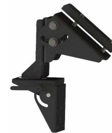
7160-1591 Tall Adjustable Overhead Guard Bar-short