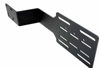
7160-0859 Number Pad Bracket