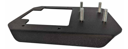
7160-1821 Honeywell RP2 Printer Mount