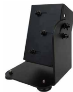
7160-1259 Flat Surface Magnet Mount with Scanner Holder