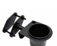
7160-1669 Fixed Forklift Cup Holder Mount