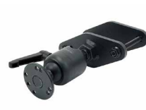
7160-1261 Zirkona 4" Diamond Plate with Large Joiner and AMPS/NEC Plate *Also available with VESA 75 mounting plate (7160-1261-01)