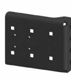
7160-1096 Clamp Bracket Adapter