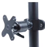
7160-1356-01 Zirkona 2" to 3" Pole Mount* *Visit GamberJohnson.com/Zirkona for additional lightweight mounting options