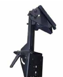
7160-1591-01 Tall Adjustable Overhead Guard Bar Mount *Also available in a shorter version (7160-1591)