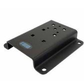
7160-1105 Flat Surface Mount