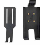
7160-1856 TC22/TC27 Non-Powered Cradle