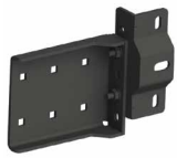
7160-1151 Toyota with Electronic Hydraulics Cab Latch Mount