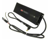
GETAC 7300-0413 12-32V Isolated 7300-0412 20-60V Isolated 7300-0416 72-110V Isolated