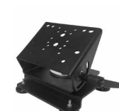
7160-1258 Magnetic Surface Mount *Also available in taller version (7160-1258-01)