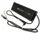
DELL 7300-0305 12-32V Isolated 7300-0306 20-60V Isolated 7300-0622 72-100V Isolated