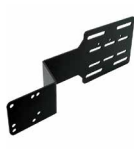
7160-0859 Number Pad Bracket