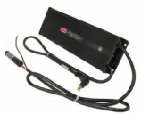
PANASONIC 7300-0464 12-32V Isolated 7300-0465 20-60V Isolated 7300-0417 72-110V Isolated