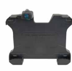
7160-1885-00 ET6X Docking Station