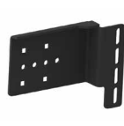
7160-1233 Toyota Cab Mount