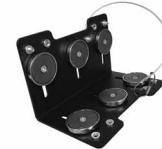
7160-0850 TYRI Redline Light Mount