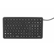
7300-0722 iKey Keyboard* *See website for full offering of iKey keyboards