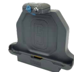
7160-1506-00 ET51/56 8" SLIM Dual USB Docking Station