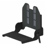
7160-0799 Tablet Tall Version Available: (7160-0799-01) Keyboard Mount