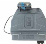
7160-1801-00 ET4X 8" SLIM Dual USB Docking Station