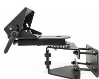
7160-1841 Guard Leg Mount w/ Locking Swing Arm Mount