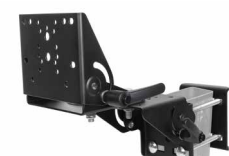
7160-0420 Dual Clam Shell with Arm and Small Backer Plate *Also available with large backer plate (7160-0421)