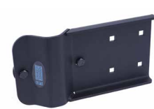
7160-0561 Guard Leg 2" to 3" Tube Clamp