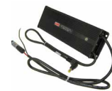
ZEBRA 90° Barrel Connector 7300-0466 12-32V Isolated 7300-0467 20-60V Isolated 7300-0418 72-110V Isolated Straight Barrel Connector 7300-0692 12-32V Isolated 7300-0693 20-60V Isolated 7300-0694 72-110V Isolated