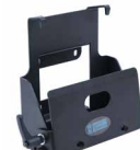
7160-0888 Datamax O'Neil RL4 Printer Bracket