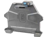
7160-1787-00 ET80/85 SLIM Dual USB Docking Station