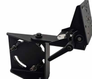
7160-1995 Guard Leg Mount *Also available with second clevis arm (7160-2020)