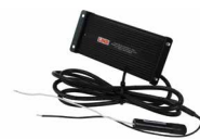
5A OUTPUT POWER SUPPLY FOR SMALLER TABLETS* 7300-0452 12-32V Isolated 7300-0453 20-60V Isolated 7300-0454 72-110V Isolated