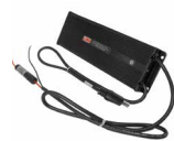
SAMSUNG 7300-0447 12-32V Isolated 7300-0473 20-60V Isolated 7300-0448 70-110V Isolated