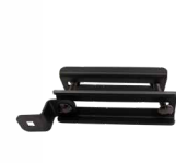
7160-1719 Forklift Light Mount