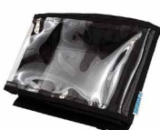
7160-0949 8" Protective Cover 7160-0950 10" Protective Cover 7160-0975 12" Dell Protective Cover 7160-1606 Samsung TA2/3/5 Protective Cover 7170-0909 Samsung TA2/3/5 Protective Cover with Thermal Cover Insert