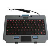
7160-1683-00 Rugged Lite Backlit Keyboard