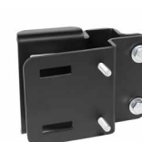
7160-0418 For Yale/Hyster, Crown and others 7160-0814 For Jungheinrich/ CAT/Toyota 7160-0815 For Linde Models EV-30 and EV40 7160-1542 For CLARK