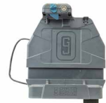
7160-1807-00 ET4X 10" SLIM Dual USB Docking Station