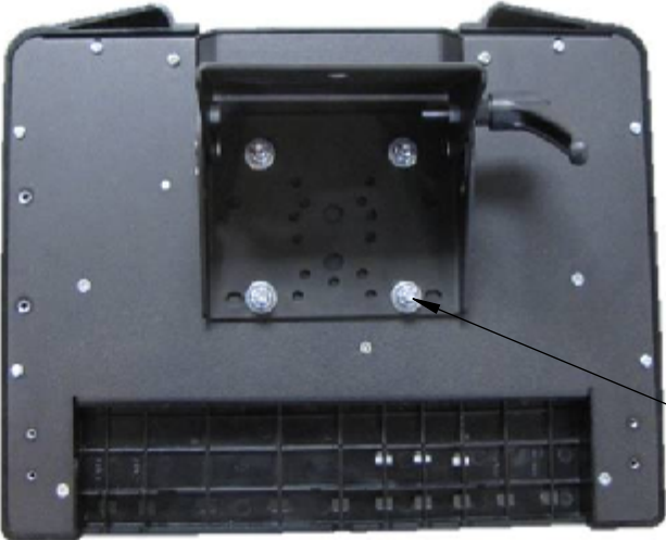
Motion Attachment attached with (4) 1/4-20 nuts and washers