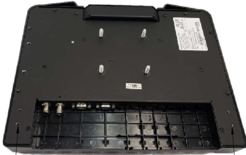
Screen Support Mounting Locations

Use #6-32 screws from screen support hardware bag to attach screen support to the left or right mounting location, do not over-torque screws.