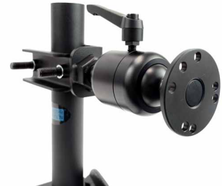
7160-1367-01 Zirkona 3/4" to 1 7/8" Pole Mount with VESA 75mm Mounting Plate 7160-1367 Zirkona 3/4" to 1-7/8" Pole Mount with AMPS/NEC Mounting Plate