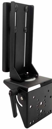
7160-1156-01 Tall Overhead Bar Mount