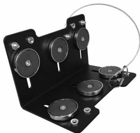
7160-0850 TYRI Redline Light Mount