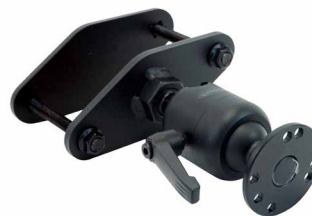
7160-1261 Zirkona 4" Diamond Plate with Large Joiner and AMPS/NEC Plate 7160-1261-01 Zirkona 4" Diamond Plate with Large Joiner and VESA 75mm Plate

When it comes to mounting lightweight devices turn to Gamber-Johnson's diamond plate mounts for a reliable solution. Multiple product offerings to interface your device with various hole patterns and ample adjustability to accommodate operator comfort and ease of use.