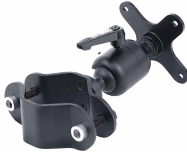
7160-1356-01 Zirkona 2" to 3" Pole Mount with VESA 75mm Mounting Plate 7160-1356 Zirkona 2" to 3" Pole Mount with AMPS/NEC Mounting Plate