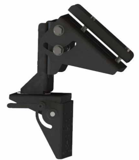
7160-1591 Tall Adjustable Overhead Guard Bar-short