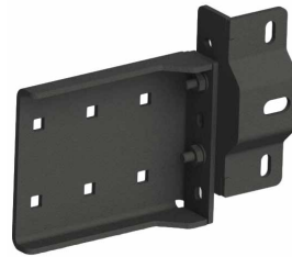
7160-1151 Toyota Cab Latch Mount for Electronic Hydraulics

Secure your valuable tablets and devices right in the cab of your material handling vehicle using one of our reliable OEM specific mounts. Perfectly suited to tailor your workspace to the most efficient, ergonomic, and secure configuration, all while protecting your valuable assets and lift vehicle operators.