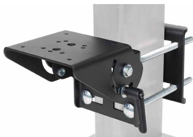
7160-0357 Clam Shell with Small Backer Plate

Our Clam Shell line is Gamber-Johnson's staple product when it comes to extending the usability of technology into the mobile world of material handling. Easily attach any device, dock, cradle, or interface plate with the multiple hole patterns featured on the product. Our Clam Shells work to tailor to individual operator comfort and safety by providing a wide range of adjustments for optimal viewing of a device, improved visibility, and proximity to the operator.