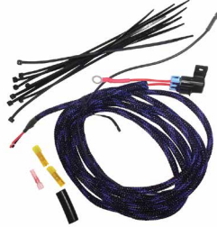
7400-0009 Wiring Kit