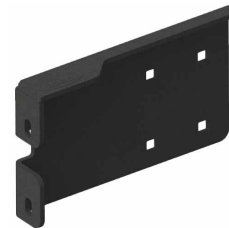
7160-1103 Linde E30 Latch Mounting Bracket