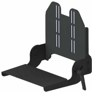
7160-0799 Tablet Keyboard Mount

Configure your keyboard for ultimate ease of use and the fastest possible access with our large selection of Keyboard Mounts. With an ergonomic angle that meets user needs, working on the keyboard in the field can be more streamlined and reliable than ever before.