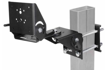
7160-0420 Dual Clam Shell with Arm and Small Backer Plate