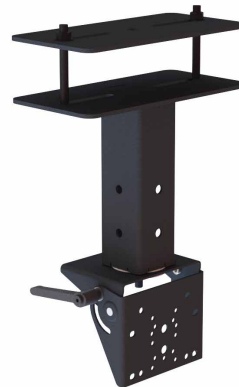
7160-0368 Overhead Guard Mount with Single Clam Shell