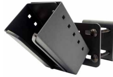
7160-1306 Scanner Pocket Mount with Small Back Plate