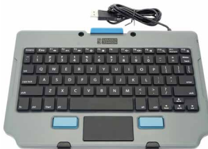
7160-1449-00 Rugged Lite Keyboard