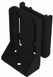
7160-0610 Single Light Bracket

Mount safety lights to present a visual alert to help increase warehouse safety, minimize the risk of accidents, and improve visible awareness of approaching lift vehicles.