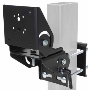
7160-0366 Dual Clam Shell with Small Backer Plate