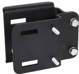
7160-0418 For Yale/Hyster, Crown, and others 7160-1542 For CLARK 7160-0814 For Jungheinrich / CAT / Toyota 7160-0815 For Linde Models EV-30 and EV40

We have the ideal products for every mounting situation; including lift vehicles that have roll formed overhead guard legs. These brackets conform perfectly to various roll formed profiles ultimately creating a solid foundation to adapt our Clam Shell product line.