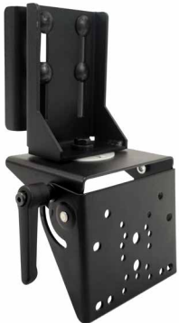
7160-1156 Short Overhead Bar Mount