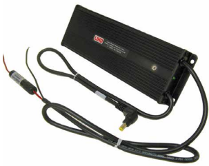
LIND Isolated Power Supply *See website for full assortment

Protect and power your valuable devices by pairing them with a clean, stable power source to guarantee functionality and longevity. Combine with a Gamber-Johnson Wiring Kit and Power Supply Mount for a professional look and quick installation.