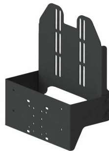
7160-1257 Vertical Tablet Keyboard Mount