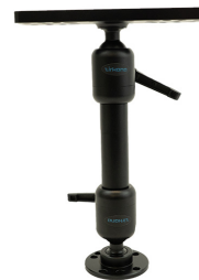
7160-1847 6" Marine Electronics Mount for Garmin®, Humminbird® and Lowrance®