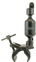
7160-1741 Action Camera Mount for GoPro and others