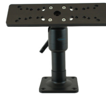
7160-1871 Extra-Large Marine Electronics Mount for Garmin®, Humminbird® and Lowrance®