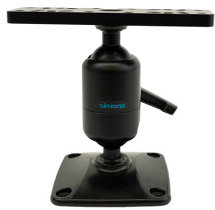
7160-1846 Large Marine Electronics Mount for Garmin®, Humminbird® and Lowrance®